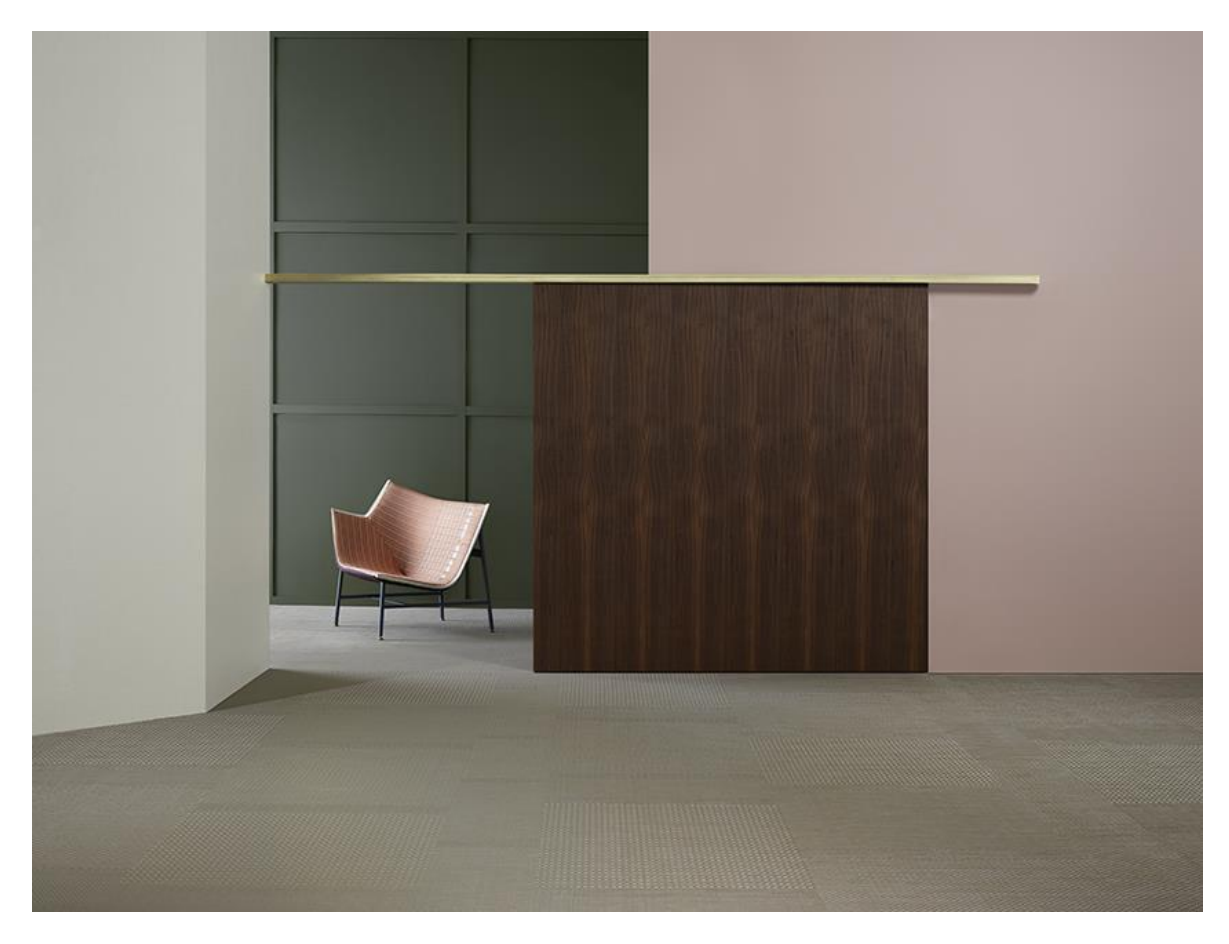
BOLON BY YOU - Weave Beige Sand Gloss